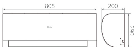
AS50 - AS71