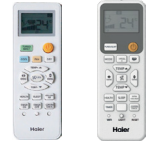
Standard YR-HE + YR-HE2