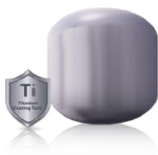
Titanium Coating Tank